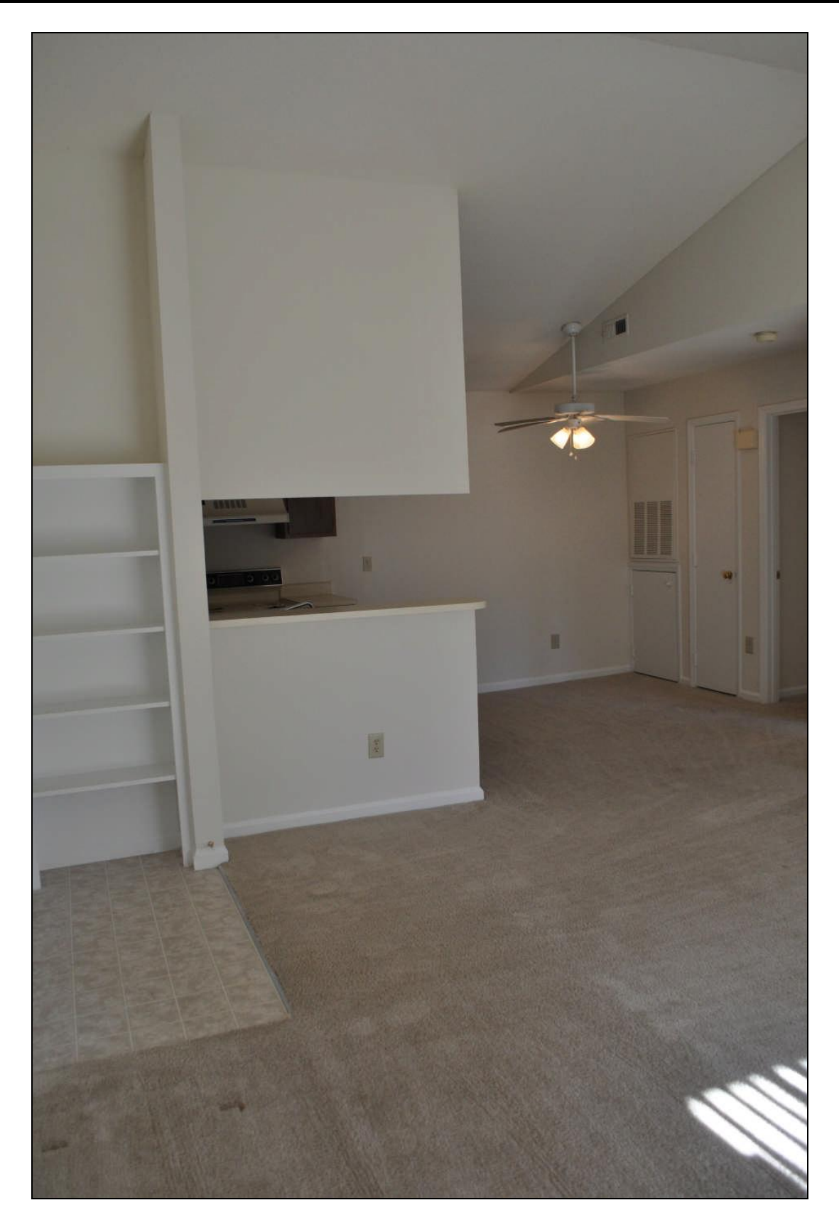
EVERY SECOND FLOOR UNIT HAS VAULTED CEILINGS