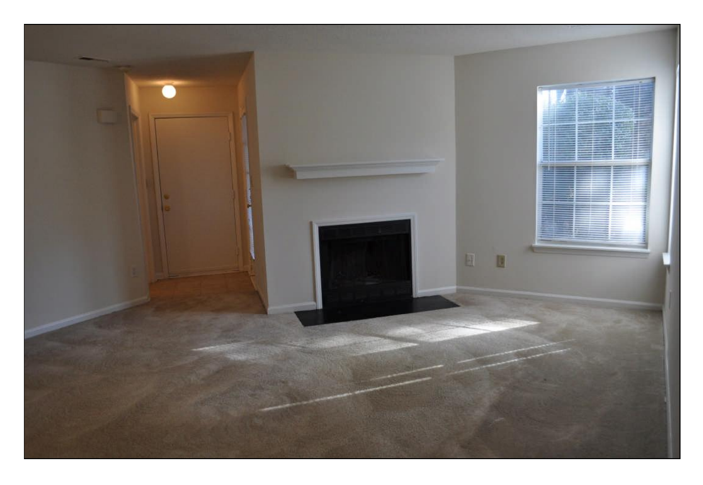
FIREPLACES AND BUILT-IN BOOKCASES ARE UNIQUE AMENITIES