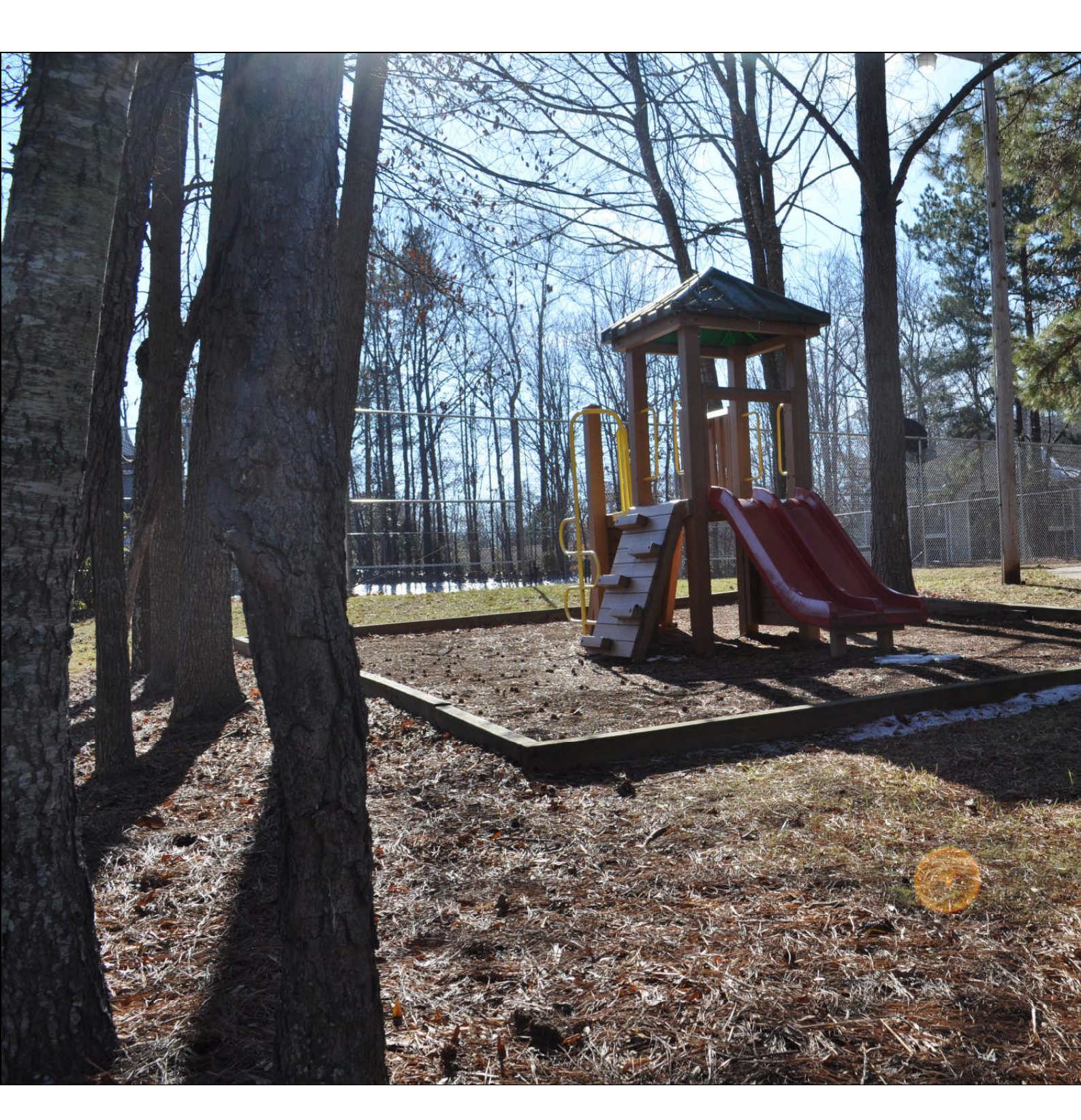
AMENITIES INCLUDE A CHILDREN'S PLAYGROUND, TWO TENNIS COURTS AND A POOL