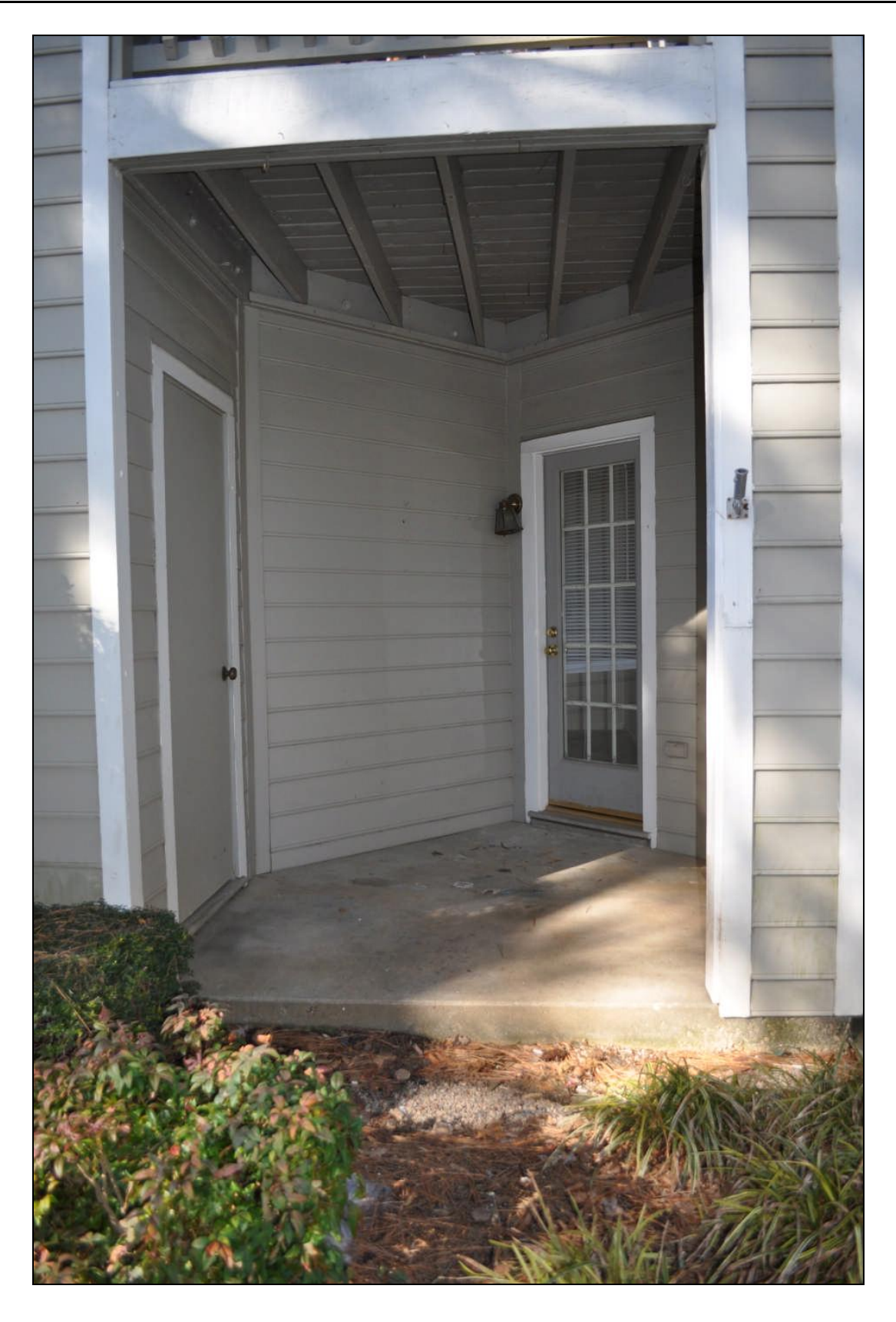
EVERY UNIT HAS AN EXTERIOR STORAGE CLOSET